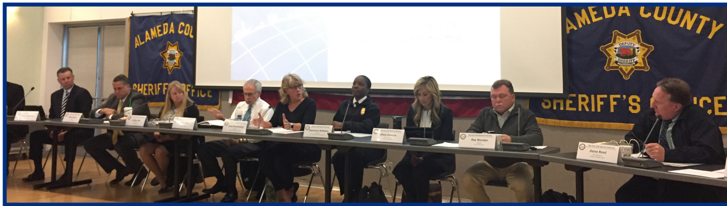
Members of the Bay Area UASI Approval Authority during a public meeting.