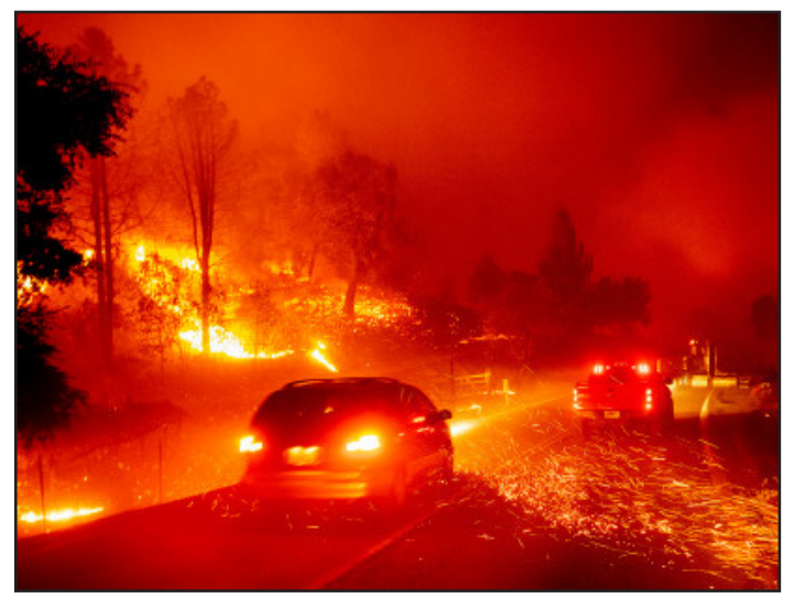
Residents flee the flames and embers from the Kincade Fire in Sonoma County.

Power distribution within California is dependent on electric lines strung over thousands of miles on vulnerable wooden poles. Following the disastrous fires of 2017-18, Cal Fire officials blamed transmission lines owned by the state's largest public utility, Pacific Gas & Electric (PG&E), for the deadly North Bay and Paradise fires. In an effort to avoid the future ignition of wildfires during periods of high winds and dry conditions, the company developed the Public Safety Power Shutoff Program.