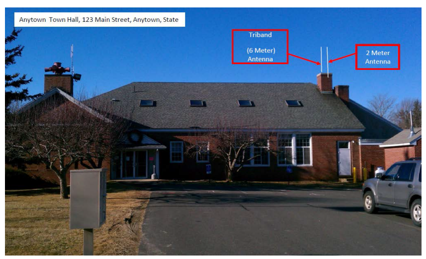
Figure 2. Example of ground-level photograph showing proposed attachment of new equipment.

Ground-level photographs. The groundlevel photograph in Figure 2 supplements the aerial photograph in Figure 1, above. Combined, they provide a clear understanding of the scope of the project. This photograph has the name and address of the project site, and uses graphics to illustrate where equipment will be installed.